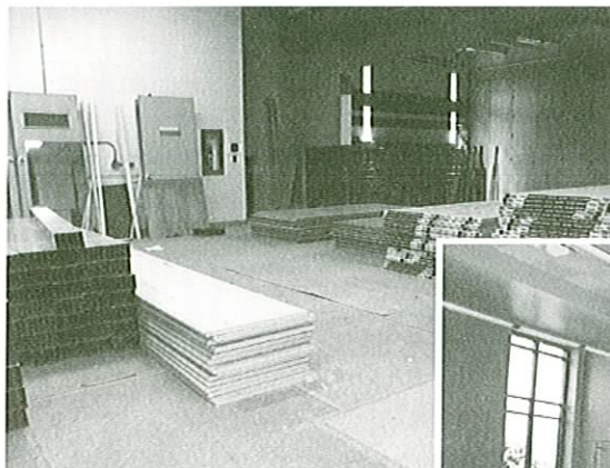
An unused stage area (above) has been converted into a new orchestra room (right) at Old Orchard Junior High.