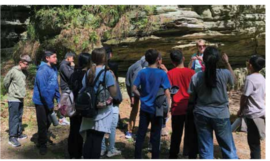
Fifth graders get a chance to explore the natural world on Outdoor Education trips.

New social studies plan prioritizes inquiry—page 2 District Notes—page 3 Letter from the Superintendent page 4